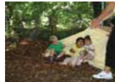
Camps & Dens