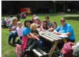
Trip to Wellington Country Park