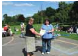
Presentation of Legoland ticket