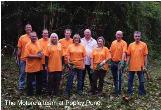
The Motorola team at Popley Pond

Recently Motorola and Basingstoke council kindly organised a work party at Popley Ponds. I would like to publicly extend thanks to Motorola for their commitment and community spirit.