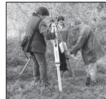
Getting things straight. Popley Conservation Volunteers setting up the level in preparation for the pond survey

For all tasks meet at Tobago Close at 10.00 am